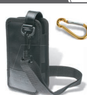
WFT510 Carry Bag and Hook