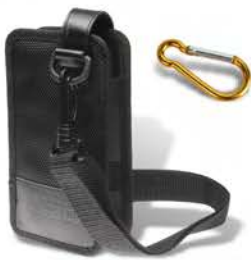
WFT510 Carry Bag and Hook