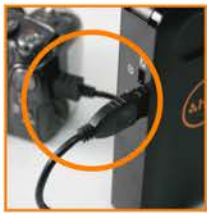
Set up the linking between digital camera* and WFT510