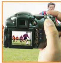
Capture an image