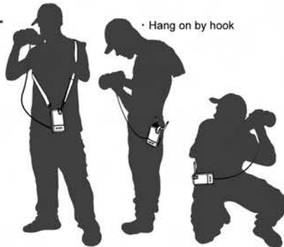
· Carry by strap