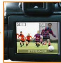
The DSC will switch to PictBridge Mode**. Choose the image and transmit to WFT510.