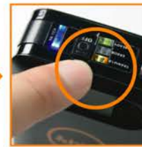
After receiving the image from WFT510, P510Si will print the photo immediately.