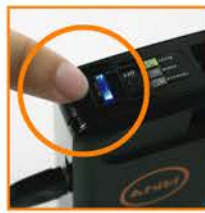
Click "switch" button on WFT510