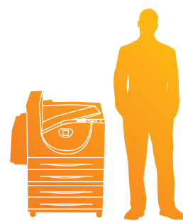
Phaser 5550DT with 1,000-sheet Feeder

W x D x H 5550N / DN: 640 x 525 x 498mm 5550DT: 640 x 525 x 778mm