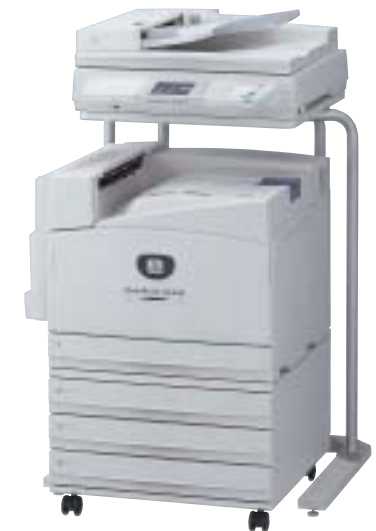
The optional scanner stand installed over a DocuPrint printer for easy access