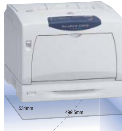
Smallest footprint that will fit any office no matter how small.