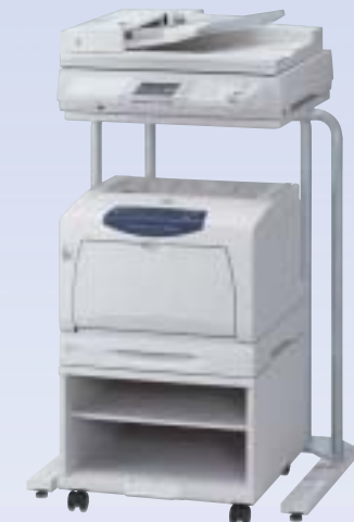
DPC3055DX shown with optional DSC4250 scanner and stand.

The C3055DX can be easily upgraded to a powerful copier and scanner. Using the DSC4250 scanner and optional stand, or additional 2 feeder with Caster kit you can scan or copy quality black and white or colour documents up to A3 size.