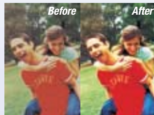
NIE technology automatically corrects dark, improperly balanced images for optimum output quality.

Now everything you need can be printed on one single, small-size printer. From postcard size up to A3 size, 60 gsm up to 216 gsm, black and white to colour - you can print everything in-house, saving time and money.