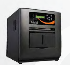
High Volume Production Photo Printers