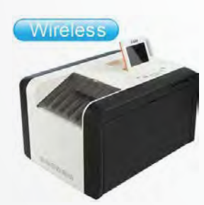
Wireless Event Photo Printers